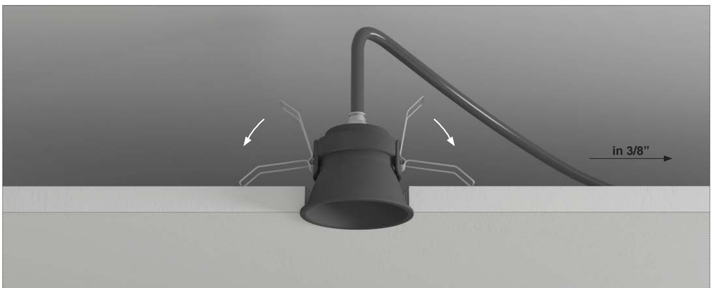
4_Gently release the two fixing levers, thus blocking the showerhead to the suspended ceiling.