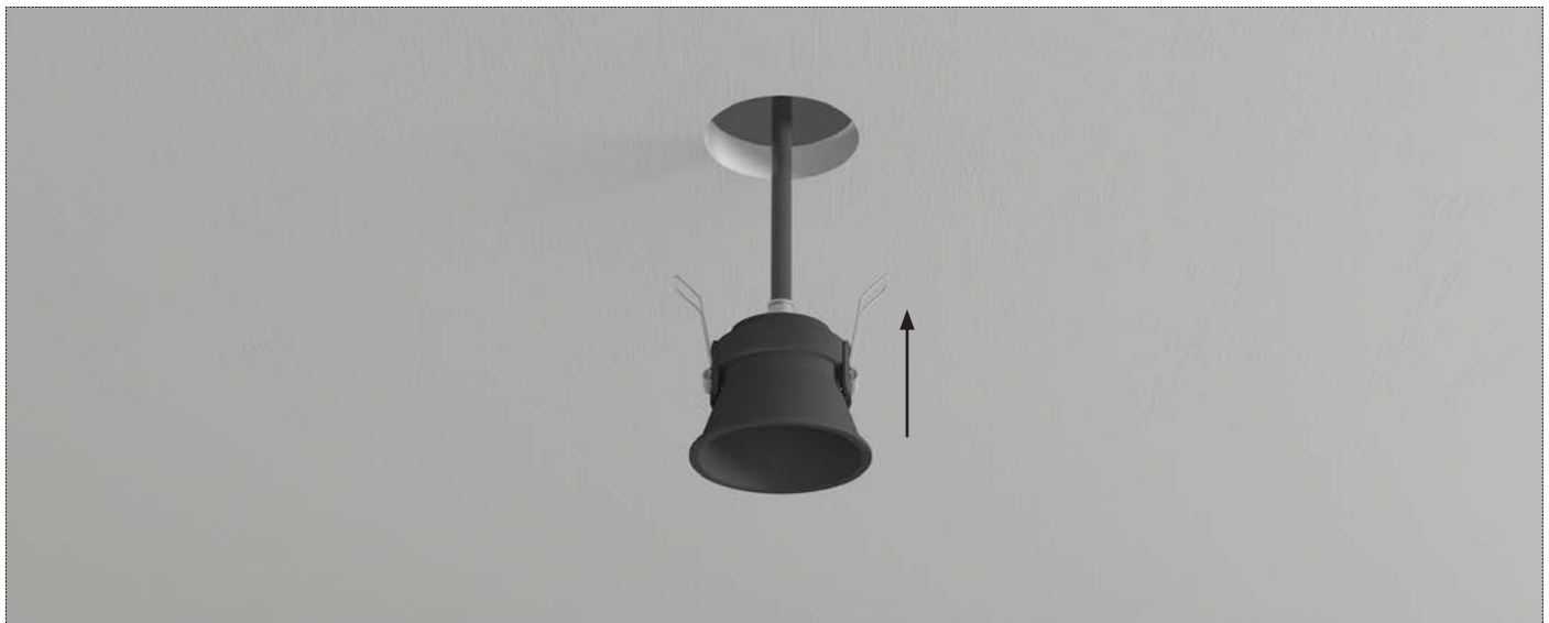
3_Insert the showerhead by moving the two docking levers upwards.